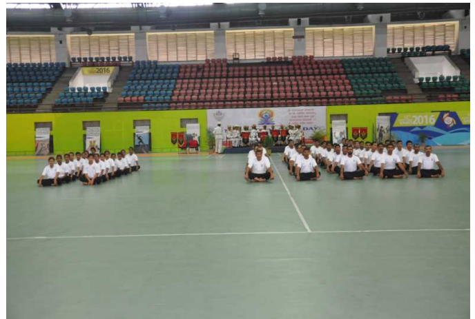
Yoga Demonstration by BSF Jawans who have attended 21 days free yoga coaching camp at LNIPE, Guwahati