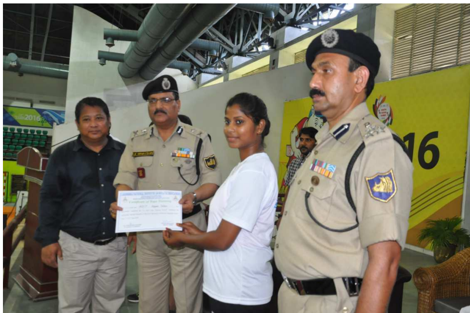
BSF Jawans are being address by Dean, LNIPE, NERC on occasion of International day of yoga and certificate distributions to BSF Jawans.